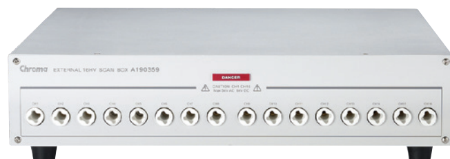
A190359: 16ch HV External Scanning Box