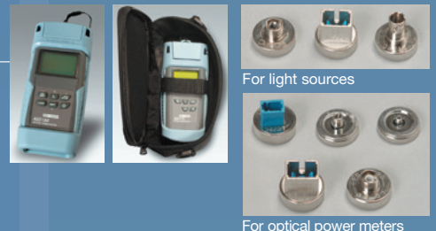
For light sources